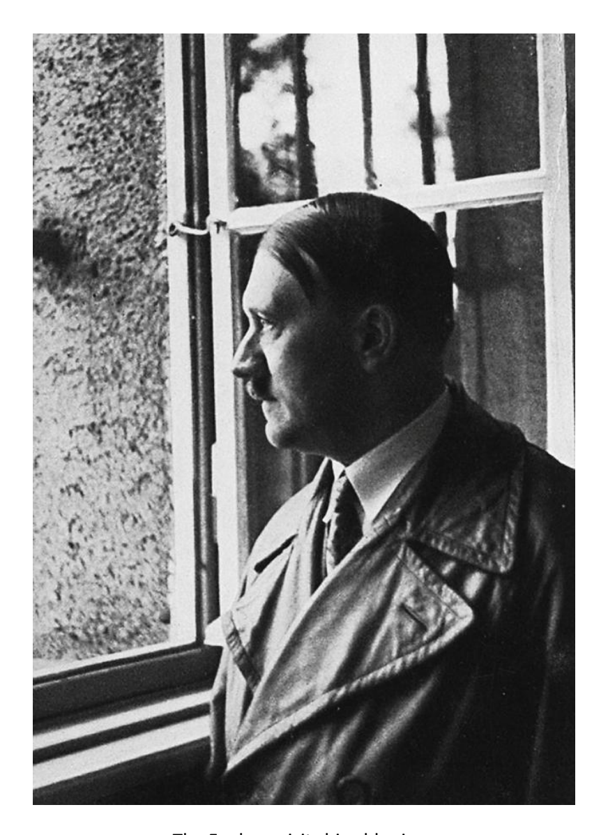
The Fuehrer visits his old prison