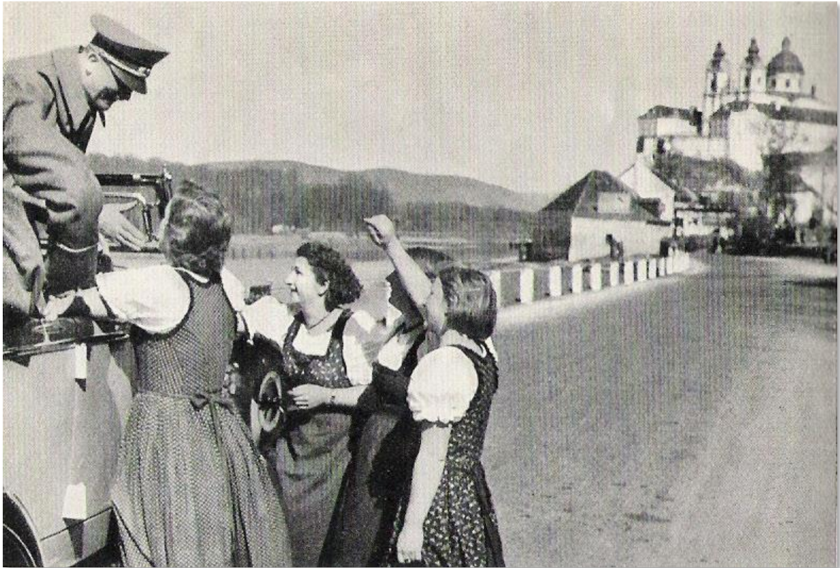
Hitler on his way to Vienna, March 12, 1938

He has the magnetic appeal of the genuine orator and has the power of making his audience feel that he is voicing their thought and speaking for them. That probably is because he himself has come from the people and is able to think and feel with them. And it is for this reason that the German youth has gathered so enthusiastically around him. In his personal requirements, Hitler is extremely modest. He does not eat meat or take any alcoholic drinks; nor does he smoke. This is simply because he feels it suits his health better to be abstemious in regard to these things.