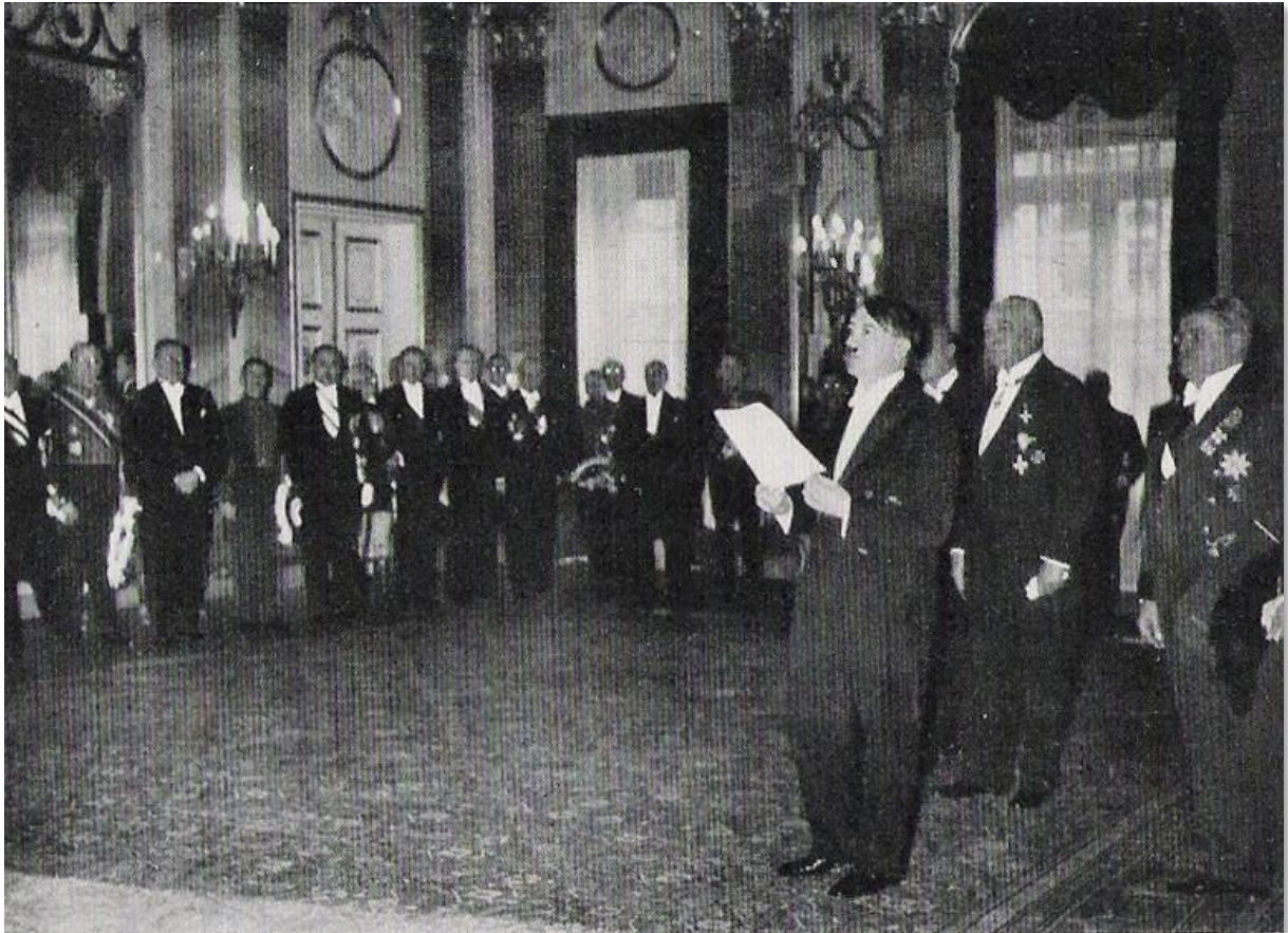
New Year Reception of Foreign Ambassadors

In the realm of higher politics Hitler was now no longer looked upon merely as a beater of the big drum, but an allround respect began to be shown for his statesmanlike qualities. His "Open Answer to Hervé", in which he replied to the French politician and stated his own opinions on disarmament and on how relations between France and Germany should best be established, brought Hitler before the eyes of the public also in foreign countries. The fight against the Young Plan led to the plebiscite of 1929, though the 6½ million votes registered on that occasion were not sufficient to prevent the Plan from being carried through. From that time onwards Hitler was accepted as the leading person who represented in the most energetic fashion the fight against the policy of German enslavement.