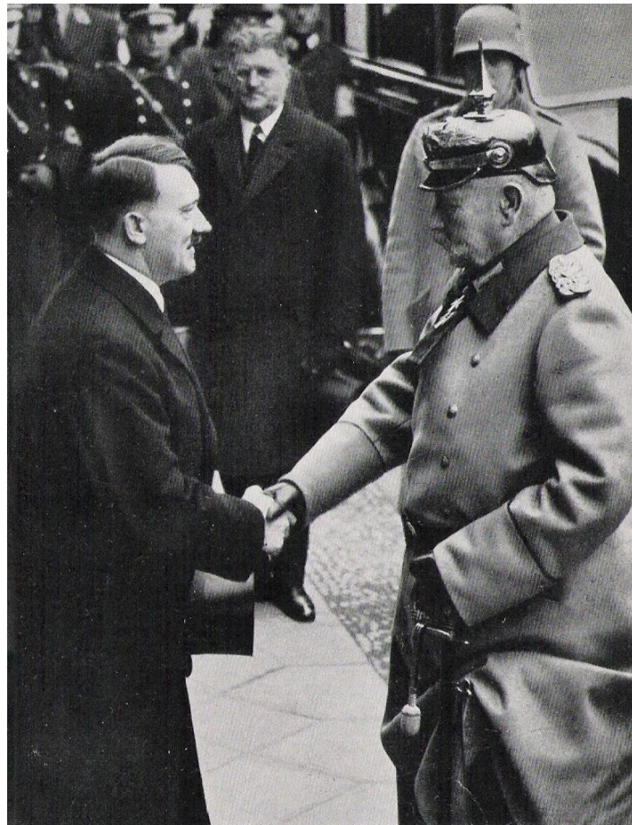
THE LATE PRESIDENT VON HINDENBURG AND ADOLF HITLER IN 1934

Towards morning it was repeatedly rumoured that Kahr, Lossow and Seisser had withdrawn from the new Government. As a matter of fact they were prisoners in the hands of the army generals who were deputizing for Lossow. Entirely on their own responsibility these generals had sounded the alarm among the army and police forces.