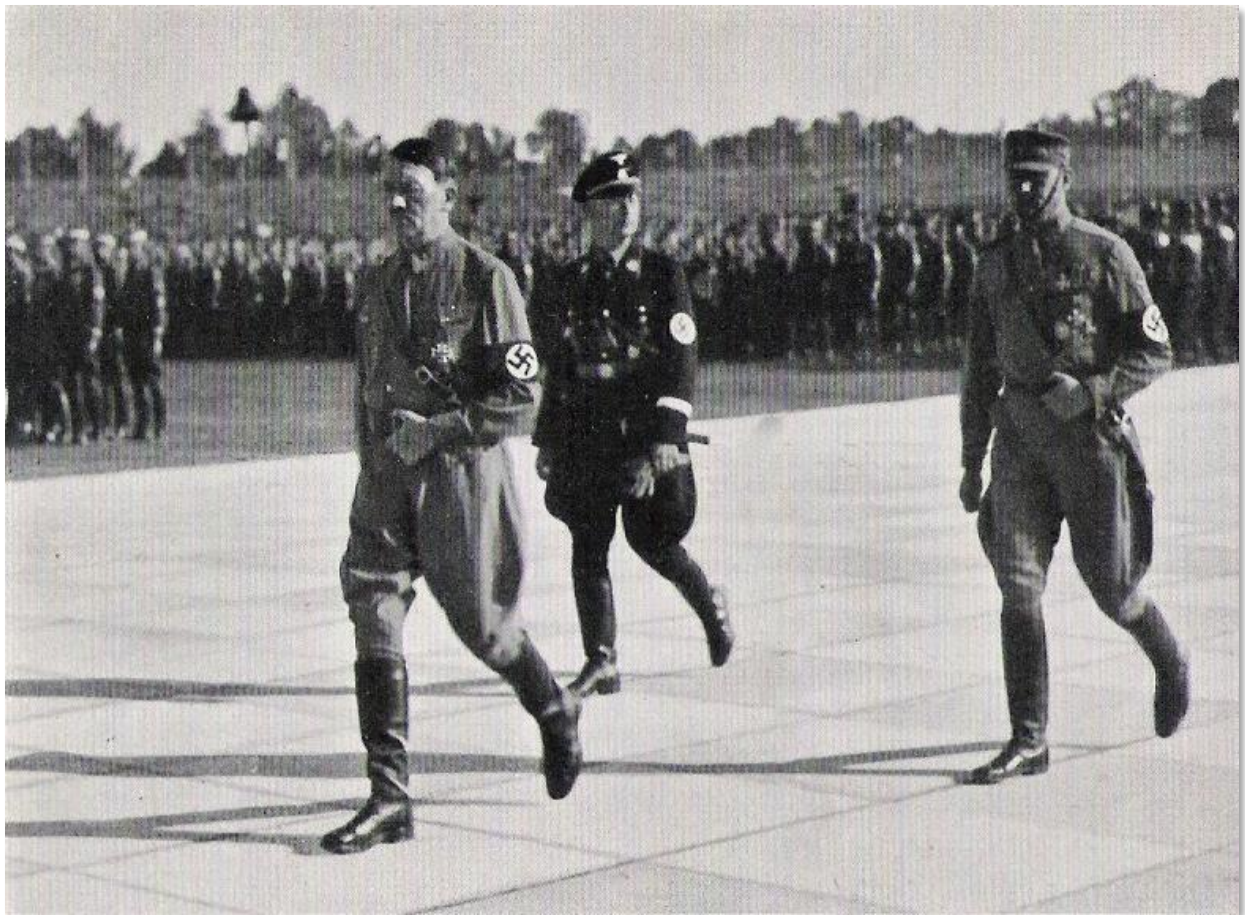
Reich Party Congress Nürnberg, 1936

In the meeting at which the movement was re-established Hitler announced that it would be conducted on constitutional lines but that the fight against the existing order of government would be a severe one. The Bavarian Government answered by forbidding the Movement the right of public speech, a step which was followed soon afterwards by most of the other federal governments. This prohibition lasted for several years.