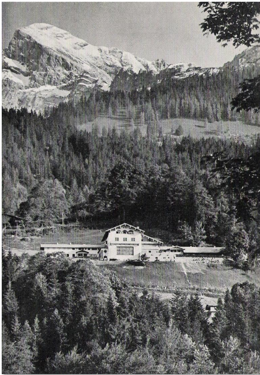
THE BERGHOF Hitler's House on the Obersalzberg

A fresh election was held on November 6. This time the result showed a reduction from 13,400,000 to 11,800,000 of the votes cast in his favour. There was a corresponding reduction in the number of National Socialist deputies, from 230 to 100. Hitler's opponents were jubilant over the result. Hitler obstinately refused to be satisfied with the Vice-Chancellorship and the Government adopted a dictatorial attitude on the other side. The situation which thus resulted created among many people the impression that Hitler had missed his opportunity and that his movement was weakening. But the jubilant cries of his opponents were short-lived. Hitler had the courage and firmness of mind to wait. At the end of January, 1933, the then Chancellor, General Schleicher, stood completely isolated. On January 28, his entire Cabinet resigned and on January 30 the President of the Reich entrusted Hitler with the task of forming a new Cabinet.