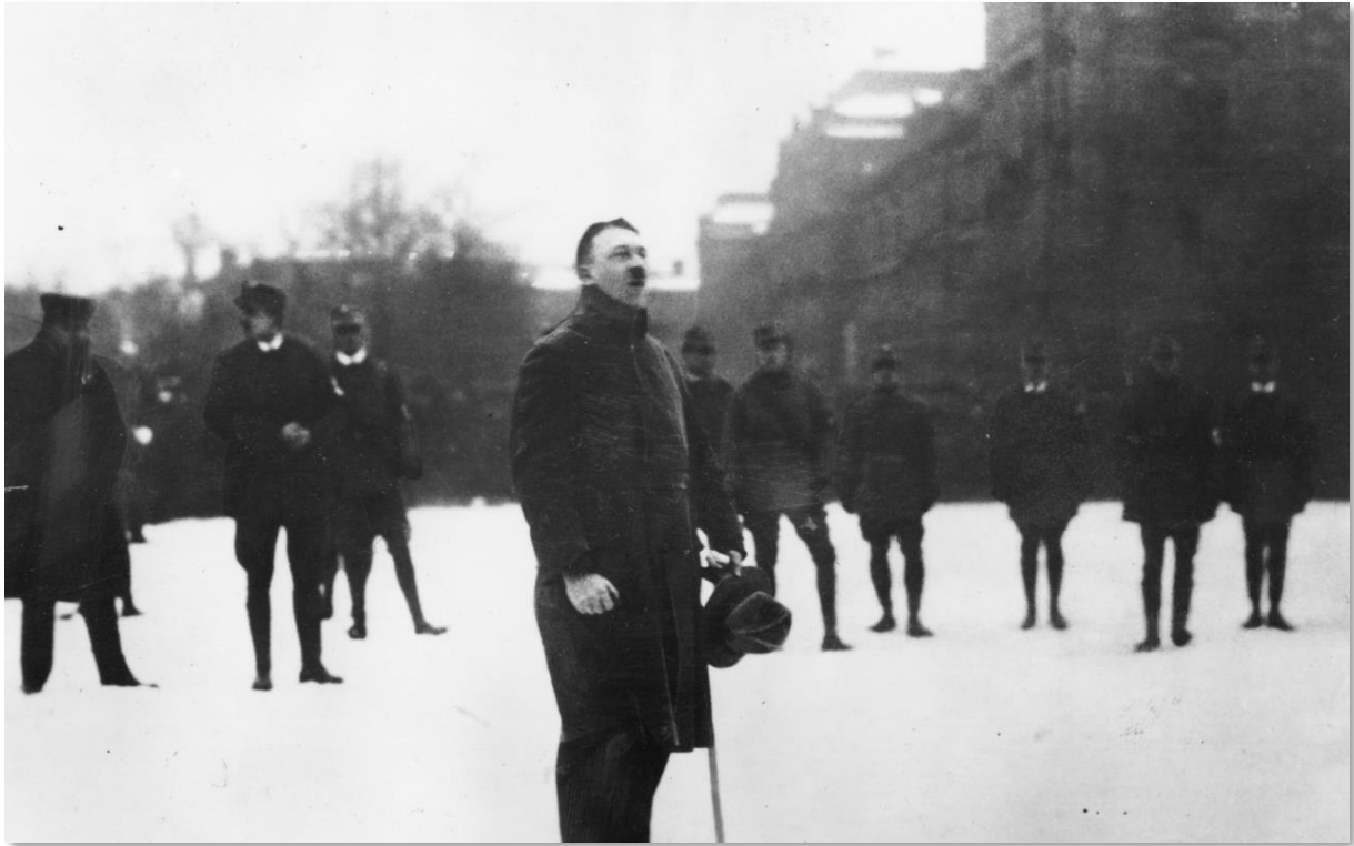
"On January 28, 1923, the first National Socialist Party Congress was held on the Marsfeld in Munich..."

13, 17, 23 and 34 respectively. At the meeting after that 111 persons were present. Hitler now spoke regularly at meetings and in that way became conscious of his oratorical gifts. He induced the committee to entrust the control of the propaganda department to him. On February 24, 1920, he was at last able to hold the first mass meeting, in the Hofbräu Haus. It was on that occasion that he promulgated and expounded the Programme of the German National Socialist Workers' Party. An attempt on the part of the communists to wreck the meeting was frustrated by a handful of Hitler's former war comrades, who had taken on themselves the responsibility for maintaining order. Hitler's contention that the Marxist terror should not only be smashed by mental weapons, but also by physical force, was proved for the first time at this meeting.