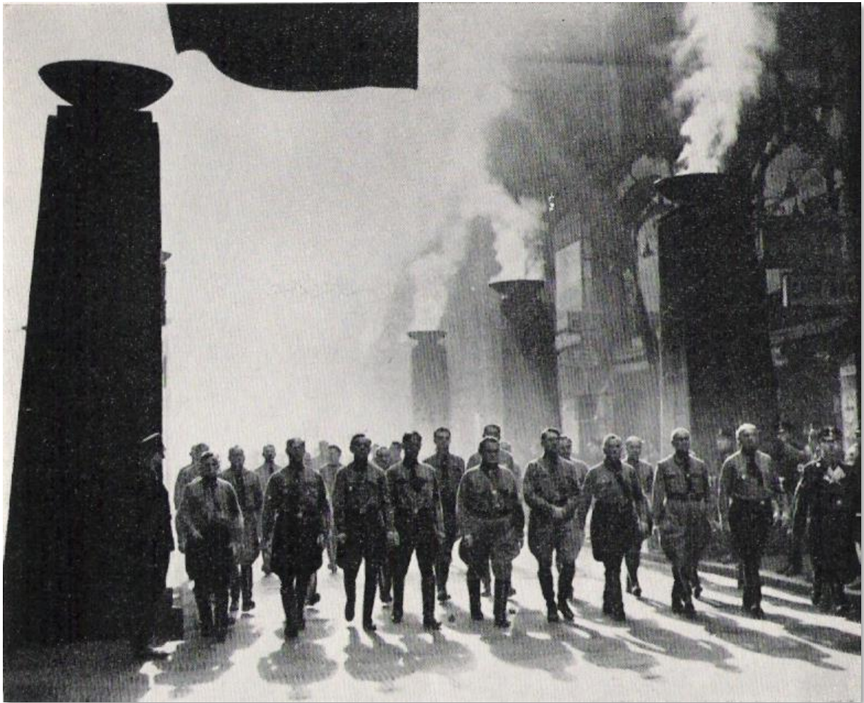
Procession in Munich, in Commemoration of November 9, 1923