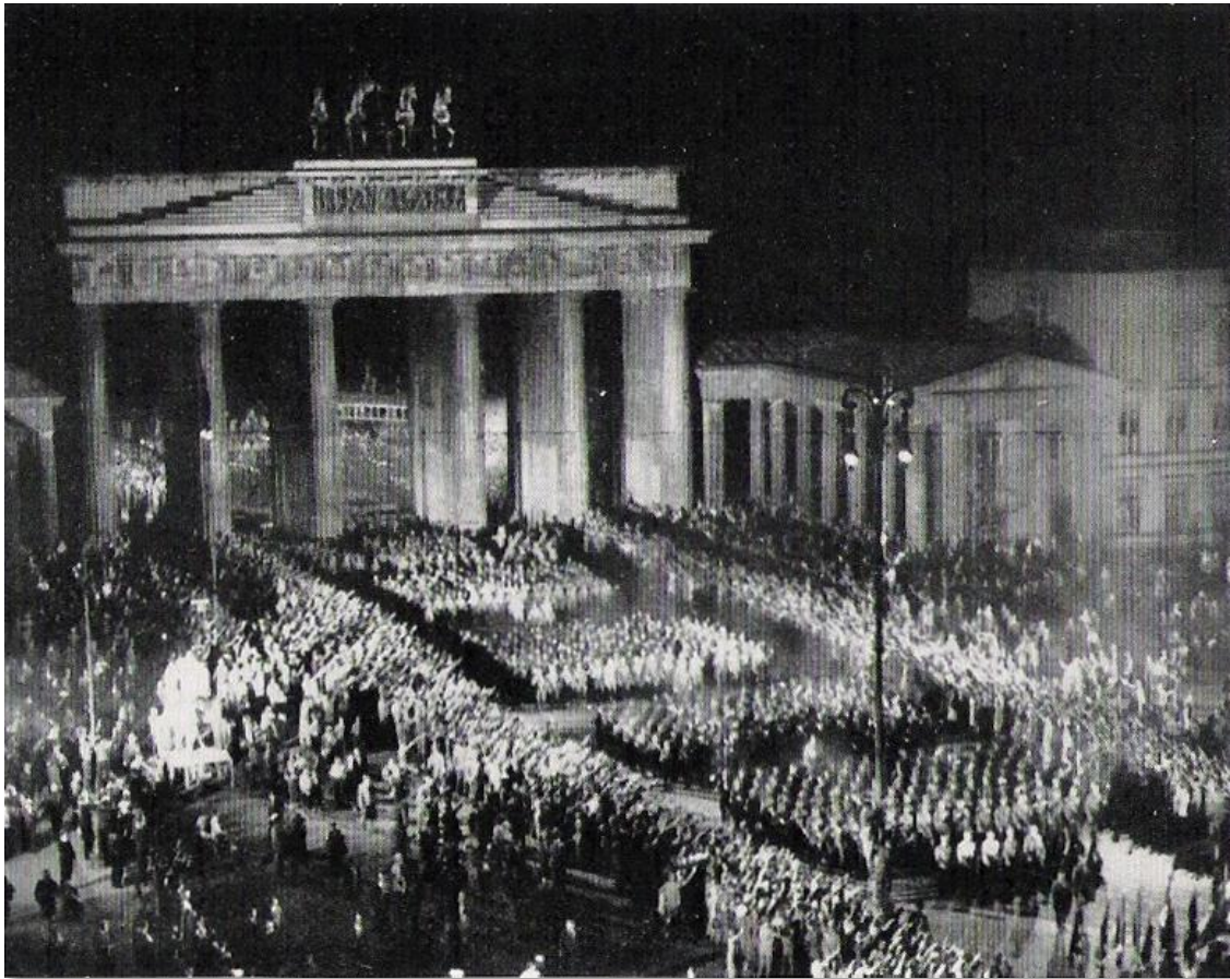
Berlin, January 30, 1933