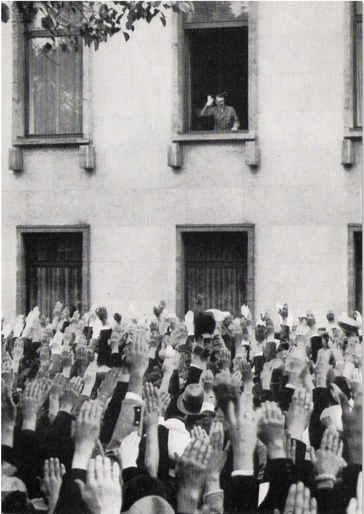
THE FÜHRER AT THE WINDOW OF THE REICH CHANCELLERY, 1934