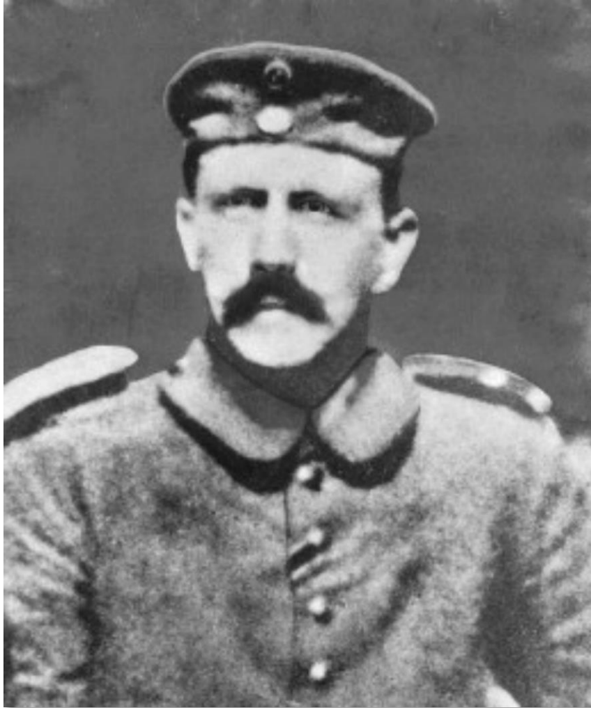
The Nameless Soldier

Though the years spent in Vienna meant a hard and bitter struggle with life, the experience gained in this school was of inestimable value afterwards. Hitler was now yearning to live as a German in Germany itself, free from the oppression under which the German element had to suffer in that potpourri of nations which made up the Habsburg Empire. So he left Vienna and came to live in Munich. That was on April 24, 1912.