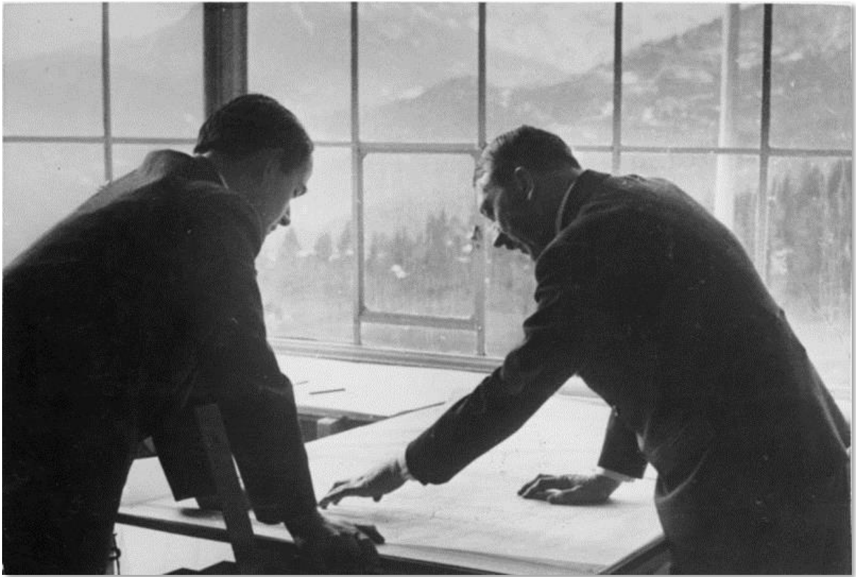
In Hitler's Studio at Obersalzberg

country 200,000,000 marks annually for support and attendance. A law was also passed to prevent the further mongrelizing of the German people through intermixture with the Jews, who are of a totally different racial stock.