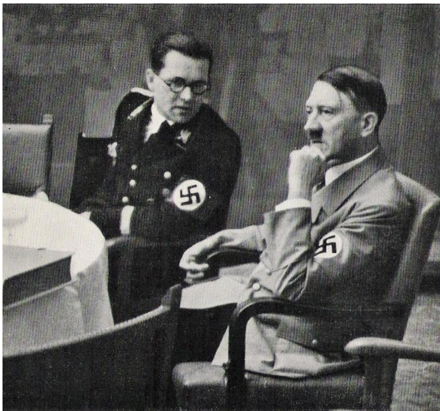
Adolf Hitler and Philipp Bouhler, the author of this biography

To understand all this one must understand and appreciate the character and personality of Adolf Hitler himself. Broad minded and big-hearted and just, capable of bringing iron logic to the support of his arguments, judicious and courageous in making decisions, and yet at the same time always prepared to share the sorrows and joys which fall to the lot of his co-workers – these are the qualities that link men inseparably to him.