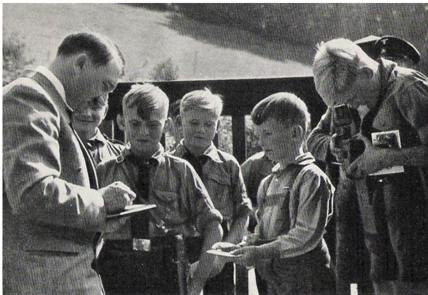
Some young Autograph Hunters

The magnitude of the victory won on March 5 was unparalleled in German history. And it was as unexpected as it was unparalleled. 17,300,000 people cast their votes for Hitler, whose name headed the list of candidates in every district throughout the country. 288 Reichstag seats were won by the National Socialist Party and this gave the Government a 52% majority in parliament. Although if the result had been different the Government were determined to follow the one and only road which would lead to the restoration of German liberty; yet the actual result made it possible to carry out the new policy on a strictly parliamentary basis. Marxism and its supporters had received a severe blow. The Communists lost twenty seats and the Centre Party was deprived of its key position.