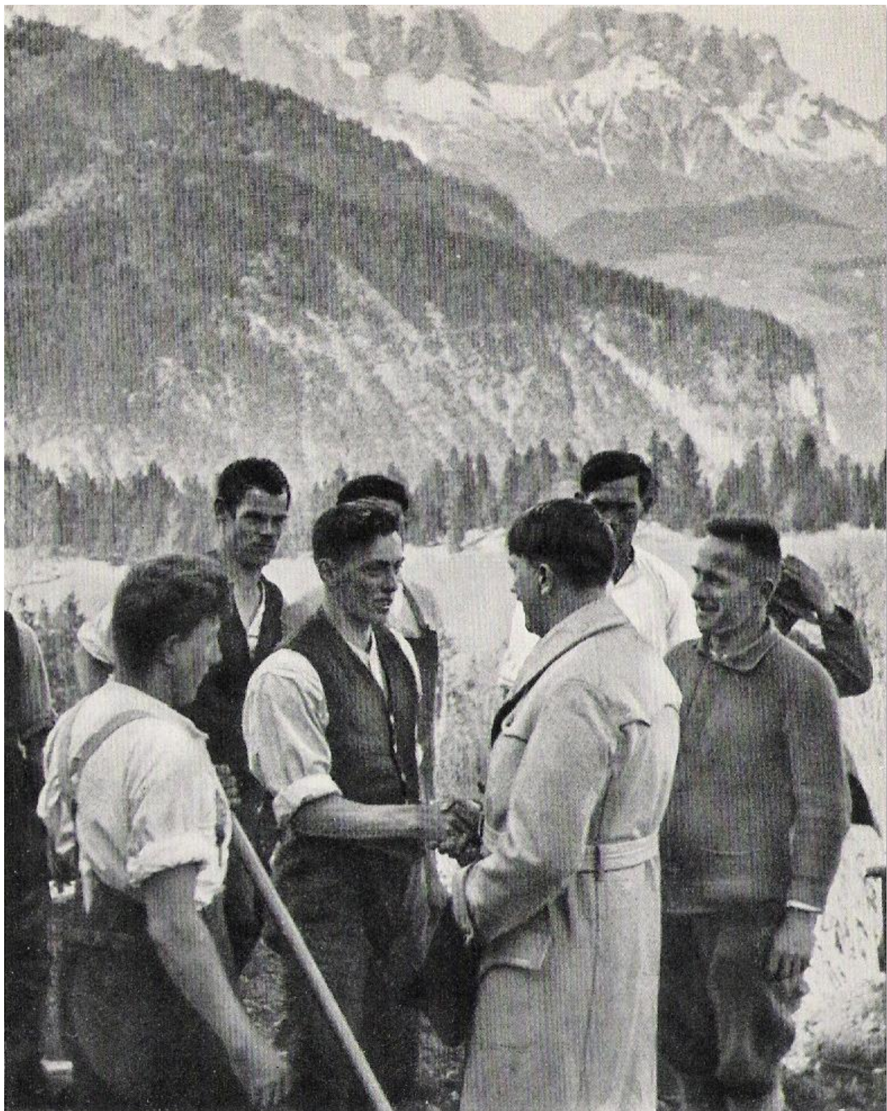
A HEARTY HANDSHAKE WITH THE WORKMEN